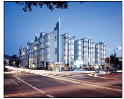
Fine Arts Building 2110 Haste Street