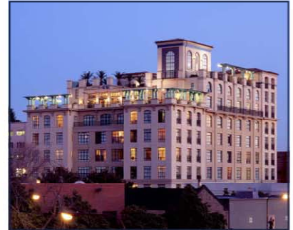
Gaia Building 2116 Allston Way