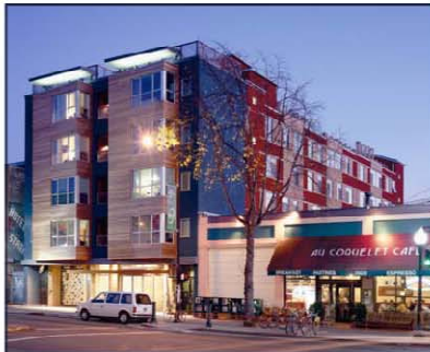
Touriel Building 2004 University Avenue