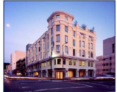
Artech Building 2002 Addison Street