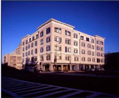
Berkeleyan Apartments 1910 Oxford Street