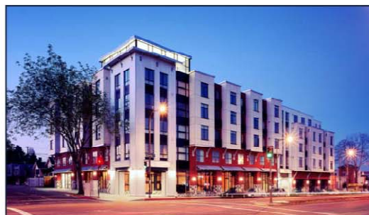
Acton Courtyard Apartments 1370 University Avenue