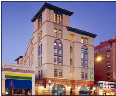
Bachenheimer Building 2119 University Avenue